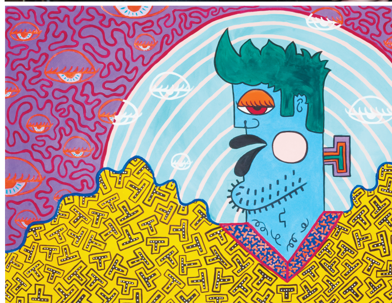
Top: Contemporary artist Taylor Bystrom. Bottom: Taylor Bystrom, New Year New T. 30 x 40" (76 x 102 cm) oil on canvas.