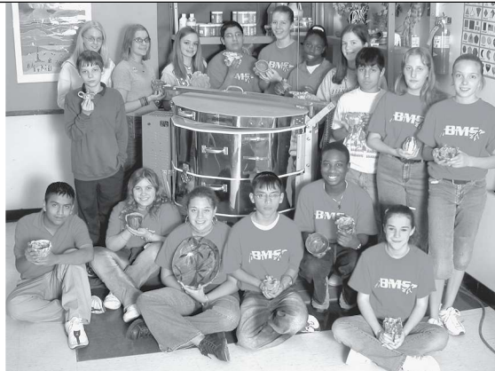
Seventh and 8th grade students at Brandenburg Middle School's Classical Center in Garland, Texas. Shown in both photos is the digital Paragon TnF-28-3 12-sided kiln.

Paragon kilns have been helping students create ceramic art since 1948. Our kilns are designed for the harsh environment of the school, where they are often neglected. They fire day in and day out with little maintenance. They are workhorses. The top row of wall bricks in the TnF-28-3 is blank (no element grooves) to prevent brick damage caused by leaning