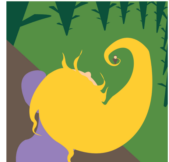
Fig. 2-X. Ella Johnson, Rapunzel simple story , 2019.

Research at least two other artists who have visually interpreted the story you chose, such as an illustrated book or film. Sketch or collage examples of their work into your journal. Then compare and contrast the moment you chose to illustrate with their images. What details are similar? What details did you focus on that are distinct from the other artists' interpretations?