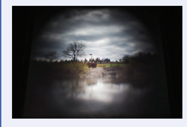
Fig. 1–12. Image of the ground glass viewing screen in a camera obscura.

pinholes in camera obscuras, producing sharper and brighter images. Mirrors were placed in the camera obscura to project the upside-down image right side up onto a ground glass, similar to the workings of today's cameras.