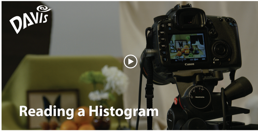
Fig. 3-13. Video: Reading a Histogram.

eBook, Chapter 3: Digital, Video: Reading a Histogram.