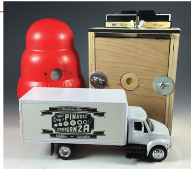
Fig. 1-46. Pinhole camera variety.