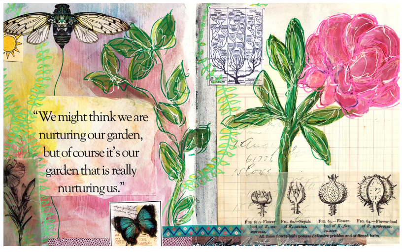
Jane Dalton, Garden Journal Page. Mixed media.

If the aim of education is to ensure the development of the whole student, then offering practices that enrich the inner life in conjunction with outer experience is not only wise, but also essential.