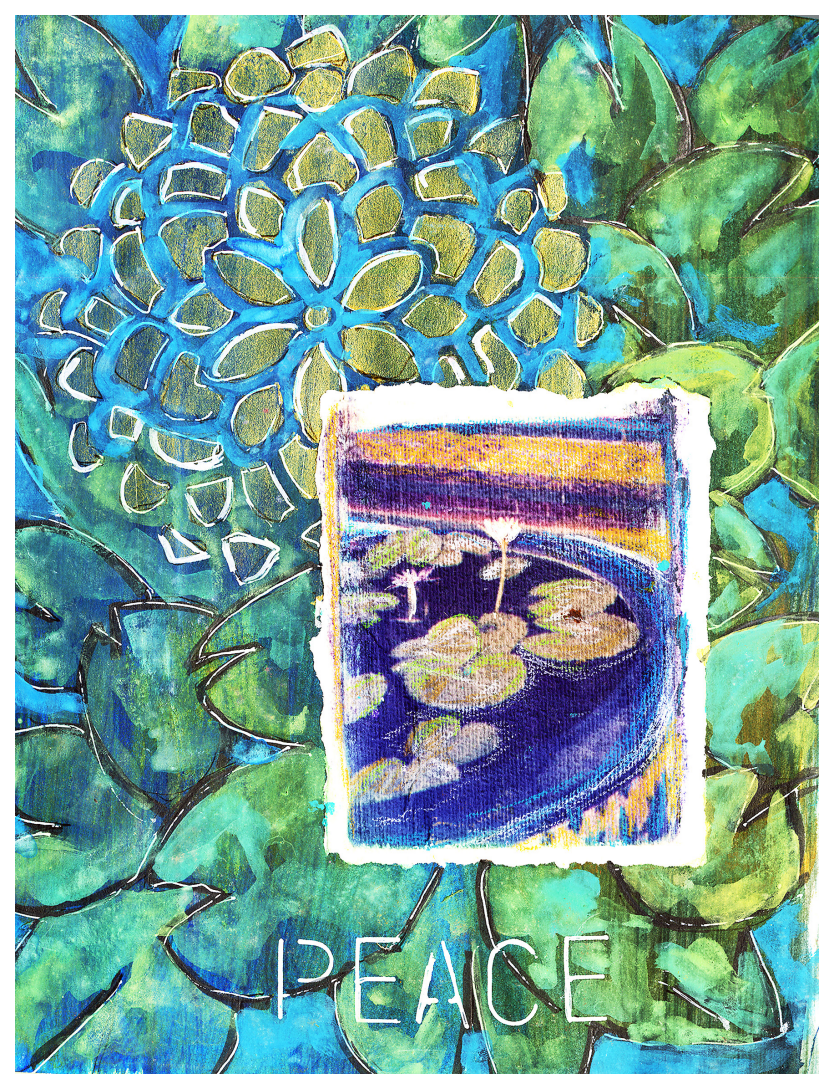
Jane Dalton, Peace Journal Page. Photo transfer, gouache, and paint pen.

This story illustrates the richness of combining expressive arts and mindfulness in K-12 teaching to engage the whole student: mind, body, and heart. Every day in classrooms, visual art quite naturally bridges students' inner and outer worlds; materials and processes speak for students in ways words cannot. Images, shapes, and colors reveal students' inner lives; creative experiences strengthen emotional well-being and promote awareness of self and others.