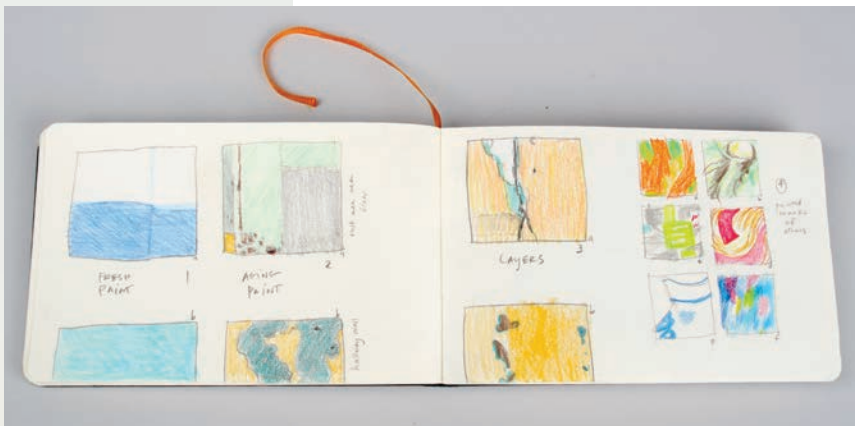
Fig. 1–35. Journal collection