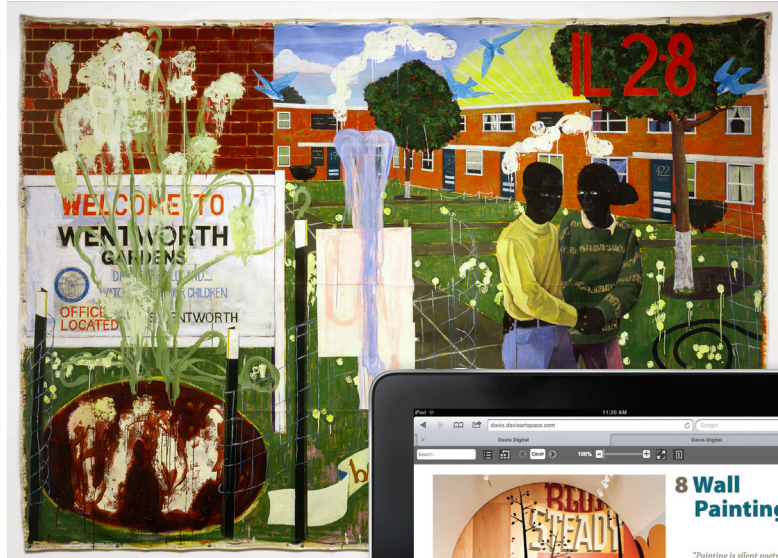
Fig. 5-19. What do you think dominates this painting: the subject, the artist's values and interests, or the painting process? Why do you think so? Kerry James Marshall, Better Homes, Better Gardens , 1994. Acrylic and collage on unstretched canvas, 100" x 147" (254 x 368 cm).