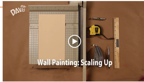
Fig. 8-10. Video: Scaling Up