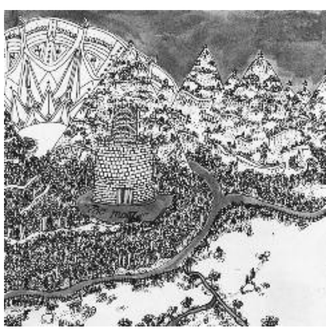
See page 6