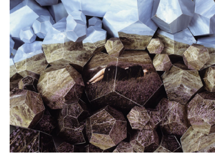
9-11 Imagine the basic photograph from which this work is made. How does the use of three-dimensional objects help add complexity and mystery to the scene?