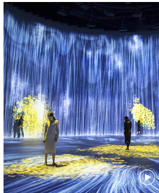
11. The artist collective teamLab uses digital technology as a means made to bring technology and people closer together in the study of nature and science. Visitors interact with the ever-changing environment. Each direct interaction with a digital environment seems more or less immediate than viewing paintings on a wall in a museum? Why? teamLab, University of Water Particle in the Tank, 2019. ©teamLab. Digital Installation in Science Museum, 100,000 Squares, Teikyo University, Tsukuba, Japan, 2019.