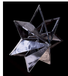
9-13 Student work. Abby Schneider. Mixed media, 15" x 9" x 10" (38.1 x 22.9 x 25.4 cm)

Reflect on the theme you chose for your sculpture. Write about how the photographs, subject, and digital editing support your theme. How does the structure you created help to convey this theme or message? Consider how you might use photographs and 3D forms in future artworks.